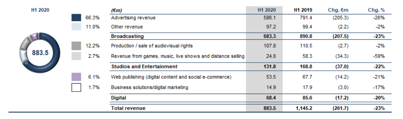
TF1 - Condensed consolidated financial statements first half of 2020